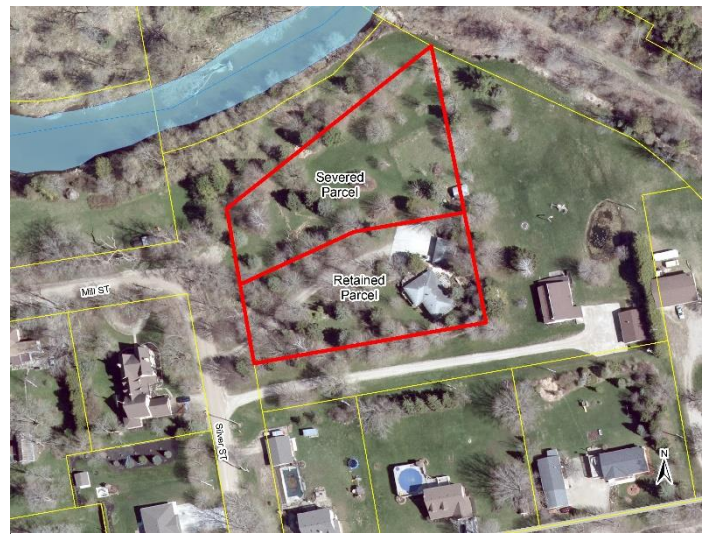
Figure 1. 2020 Aerial photo

The purpose of this application is to provide relief from the minimum lot frontage requirements. This variance is associated with consent application B85/21, that was granted provisional approval by the Wellington County Land Division Committee.